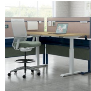
Xsede Height Adjust

When it comes to today's open office floorplans, visual expression is a significant factor in choosing the right configuration. But, that selection must also provide proper functionality to create a successful workspace. Our non-panel-based workstations empower users to effortlessly construct the ideal workspace – from heads down focus to lively collaboration...and everything in between.