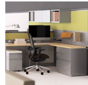
Traxx & Tiles